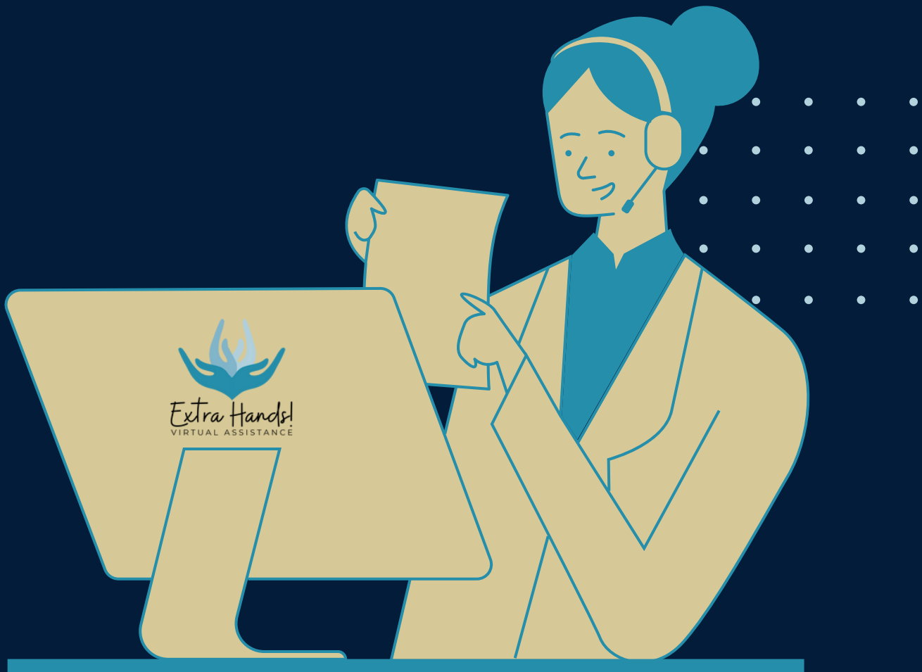
Figure Out Your Budget